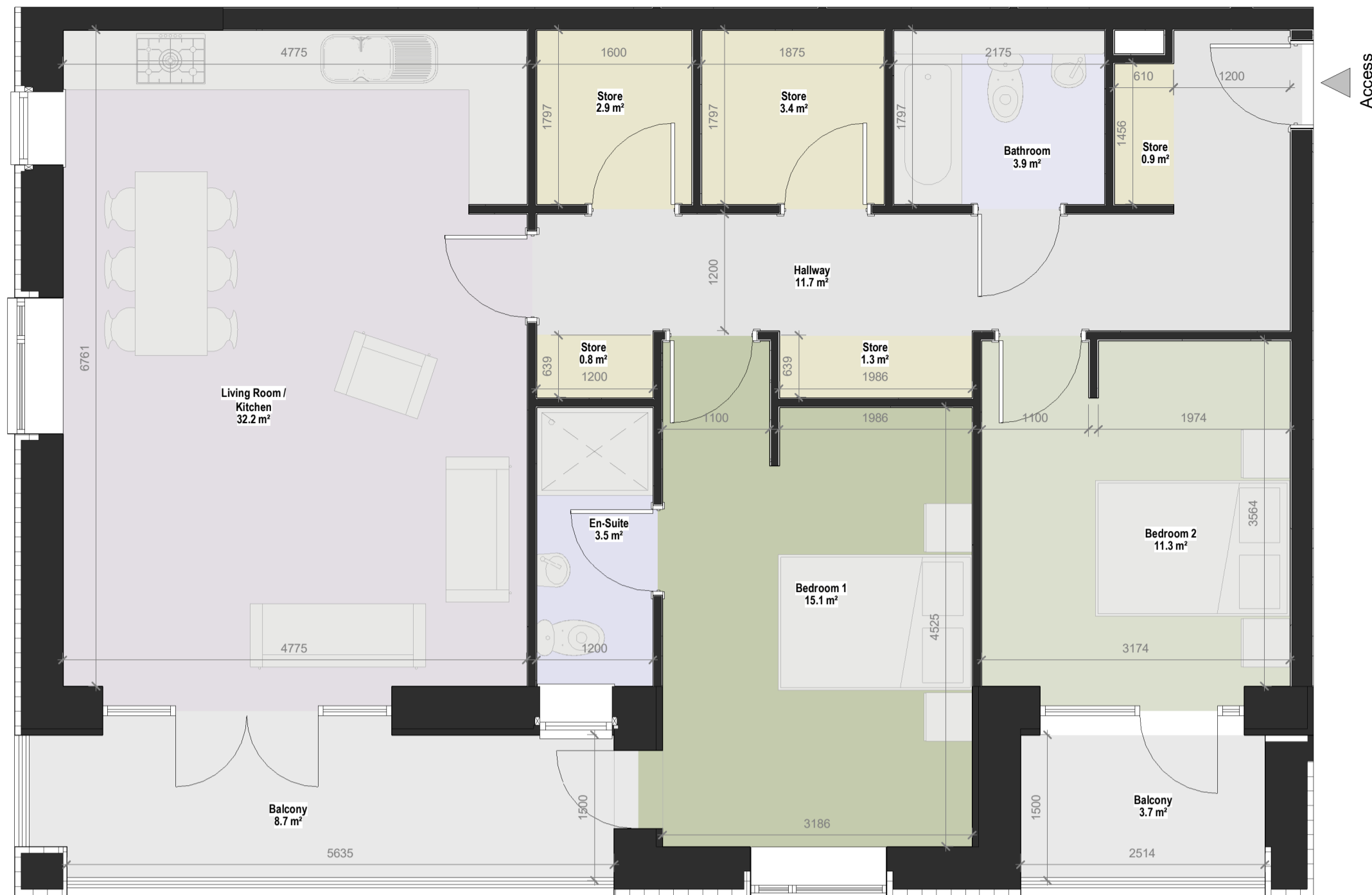
1 01 - First Floor Plan Block F - Type F 1 : 50