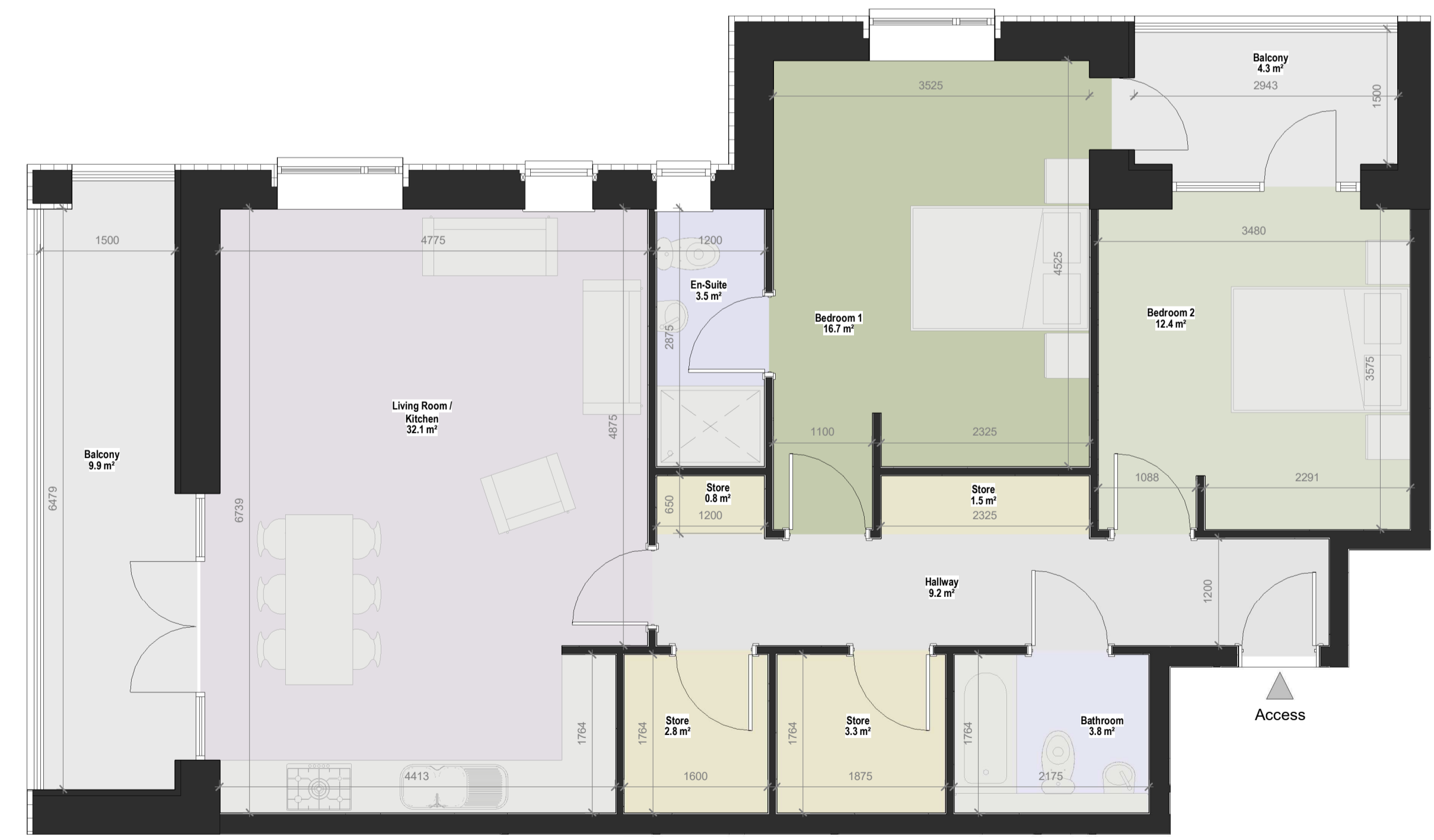
3 01 - First Floor Plan Block F - Type G 1 : 50