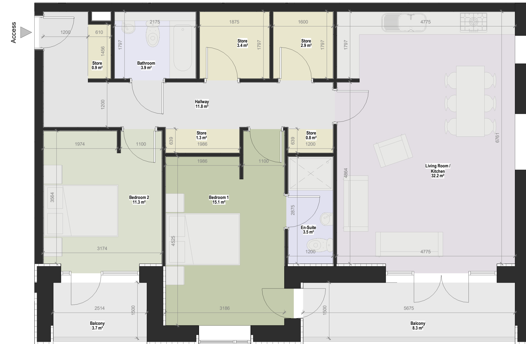
2 01 - First Floor Plan Block F - Type F.1 1 : 50