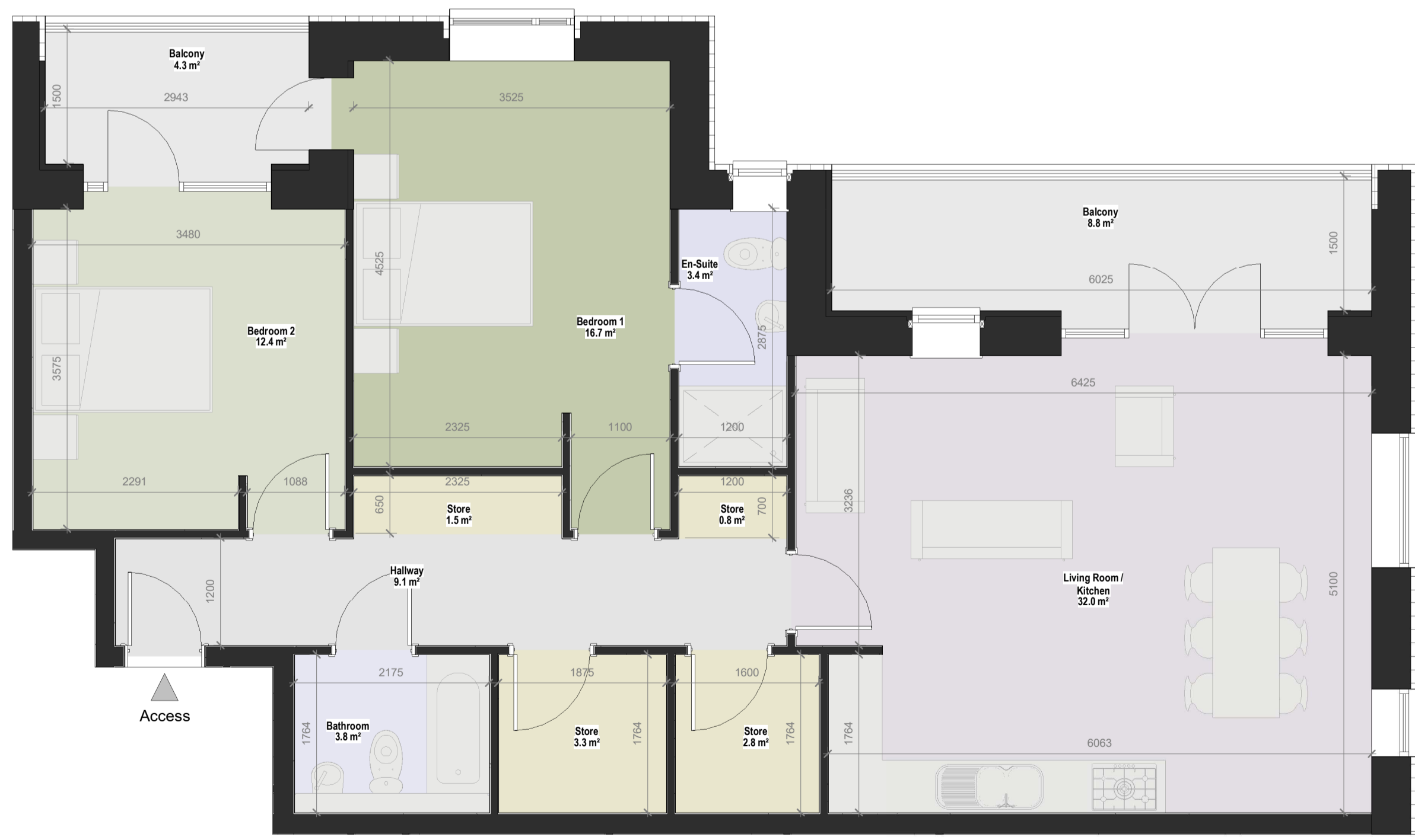
4 01 - First Floor Plan Block F - Type H 1 : 50